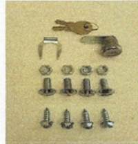
Hardware & Key Set